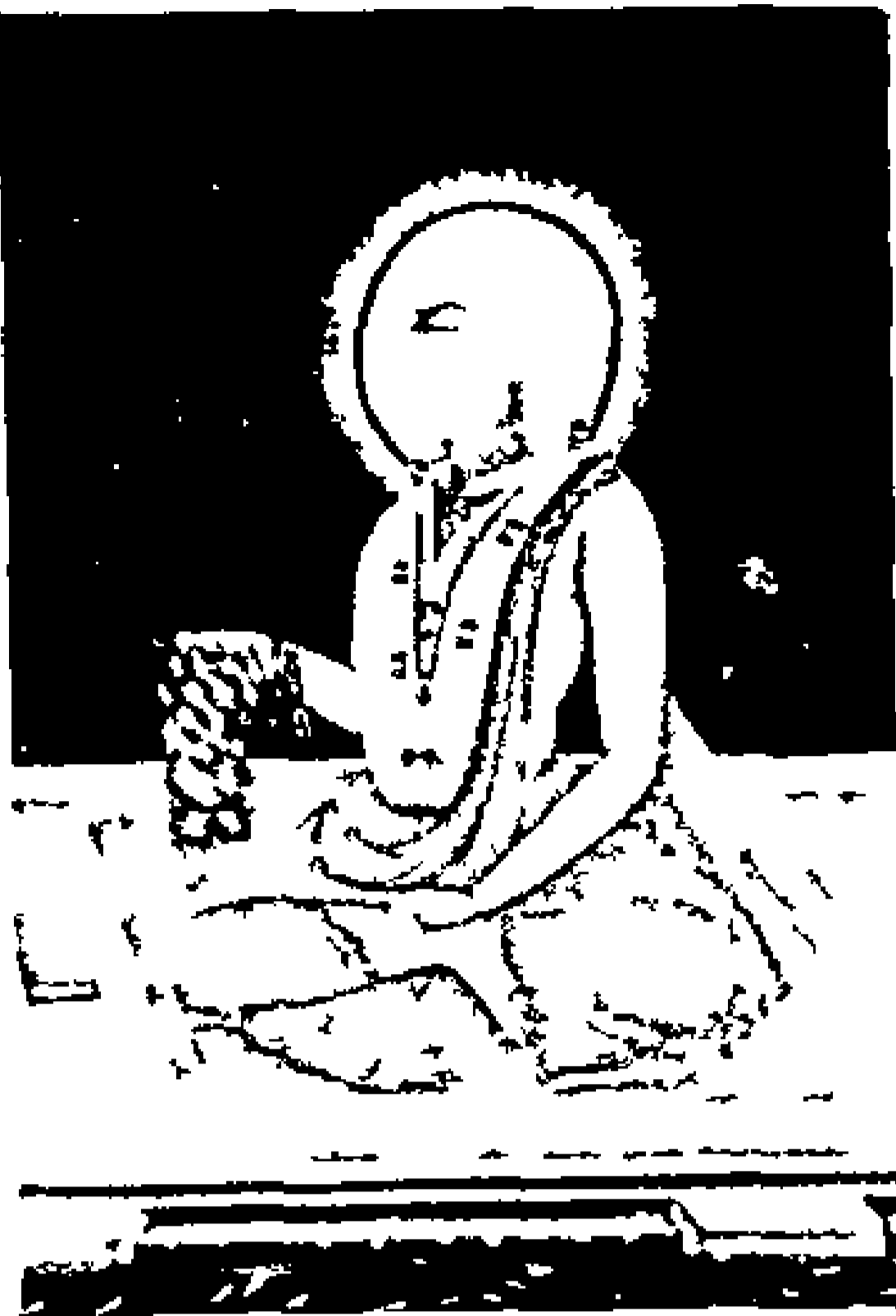
Goswami Shri Vithaleshwara See page 342